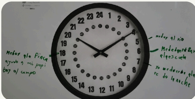
The above example of the clock activity includes “going to the river” at five in the morning before “going to school,” and “going to the farm to help my dad” after school.