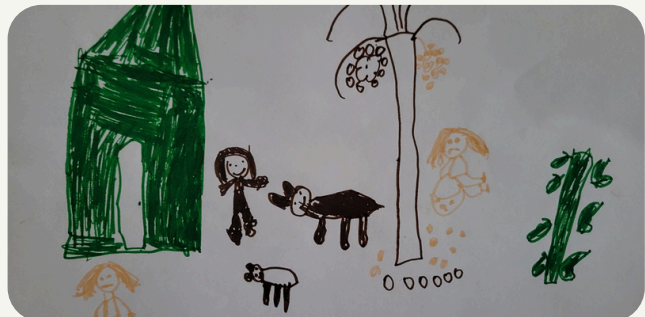
A drawing made during this activity shows a person with a sad face picking seeds beneath an oil palm tree.